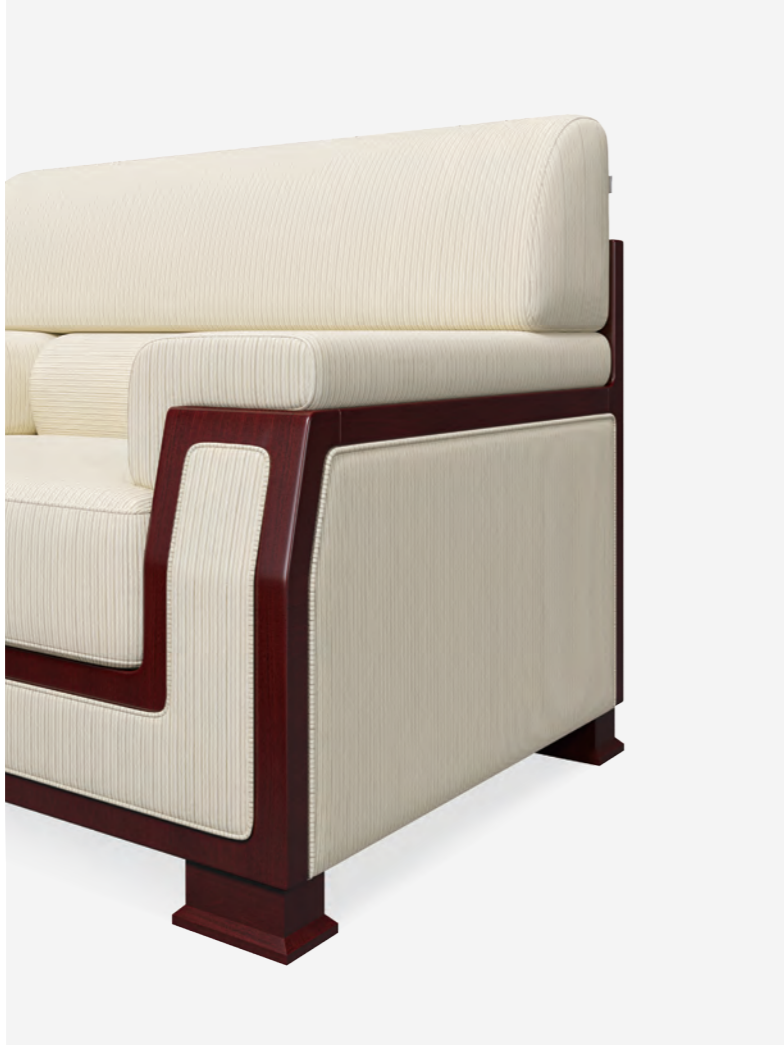
G2's recessed wood frame reflects the urbane and reserved temperament of a gentleman.