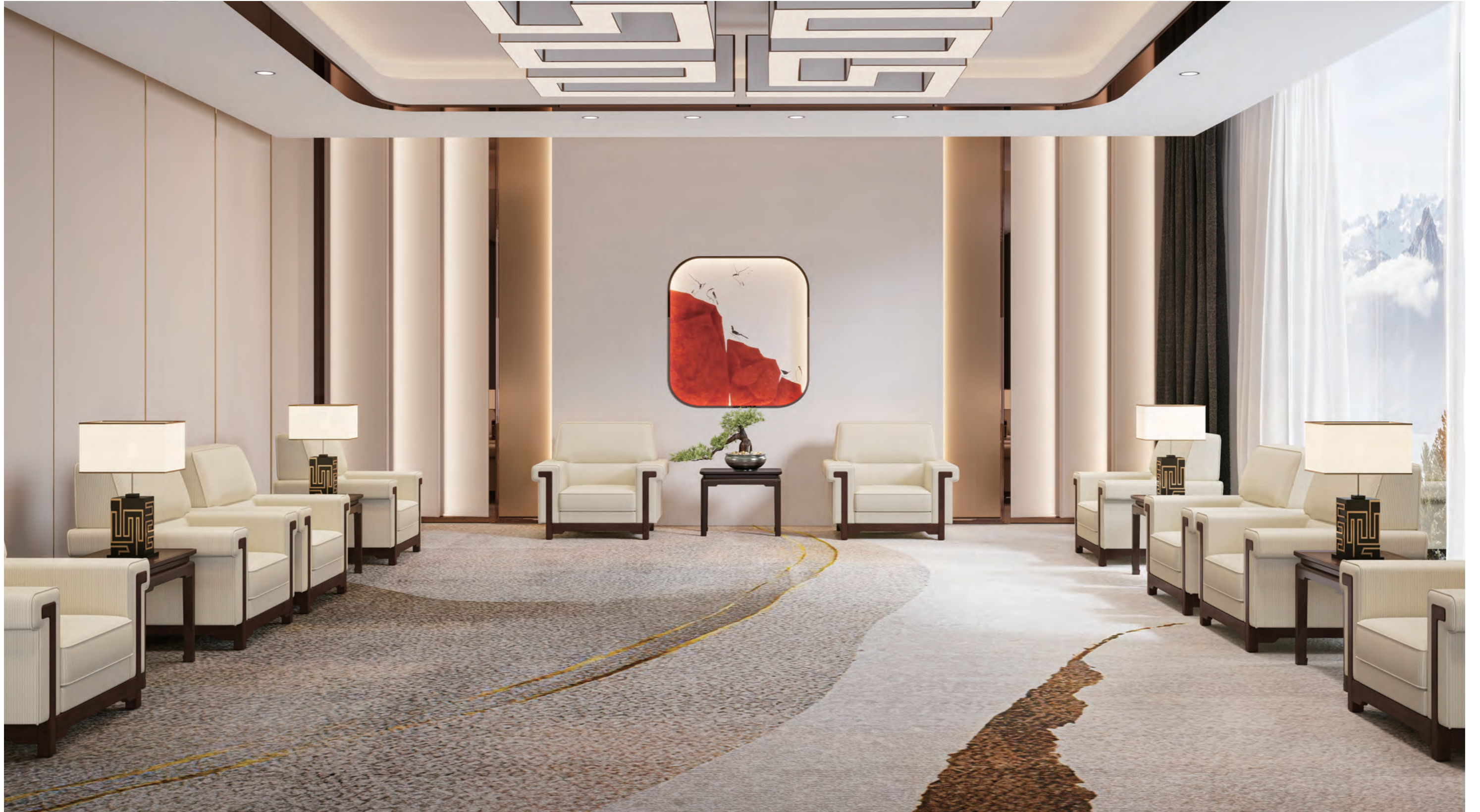
Have a glimpse of the traditional Chinese aesthetics.