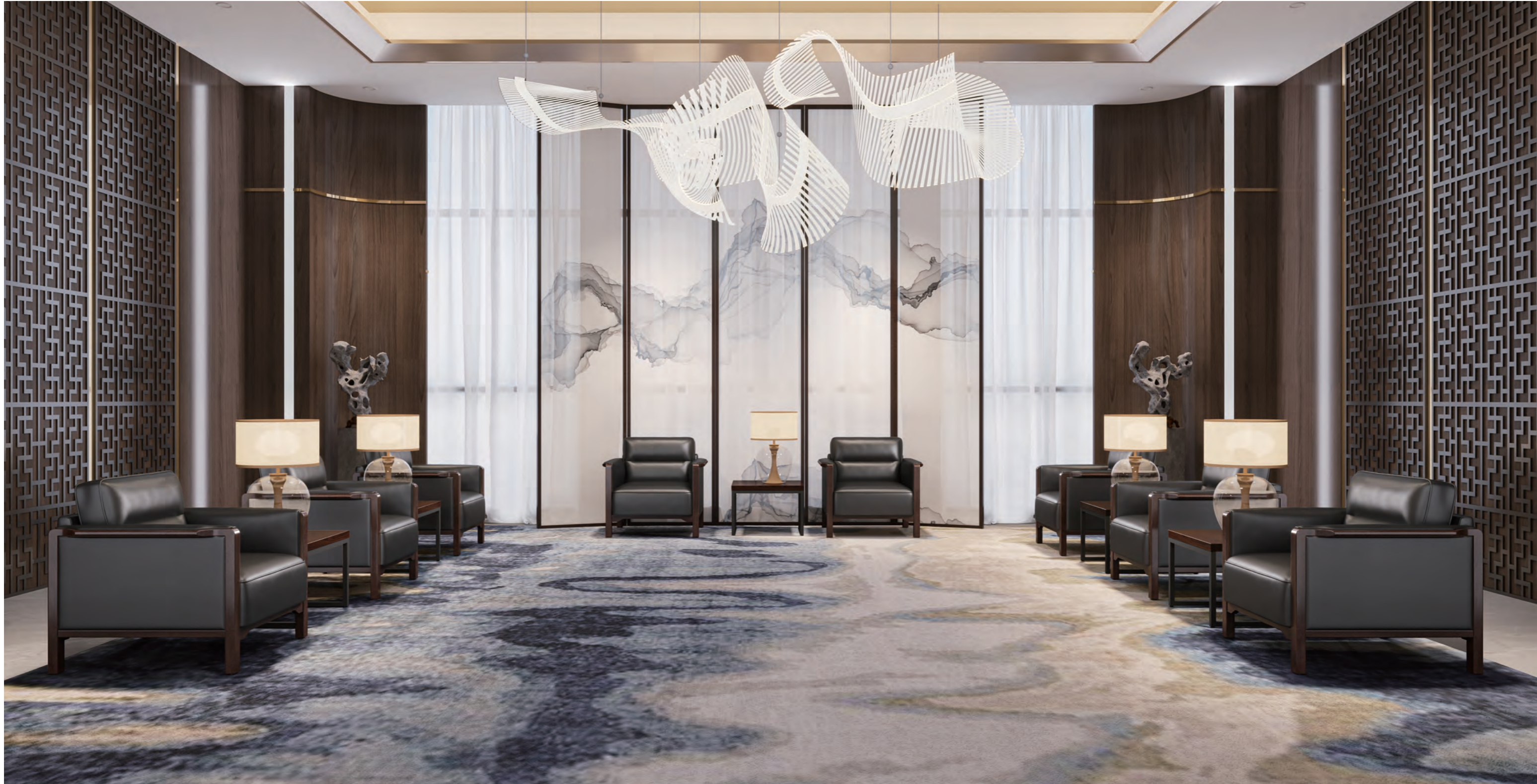
Glory-An artistic fruit of Chinese aesthetics.