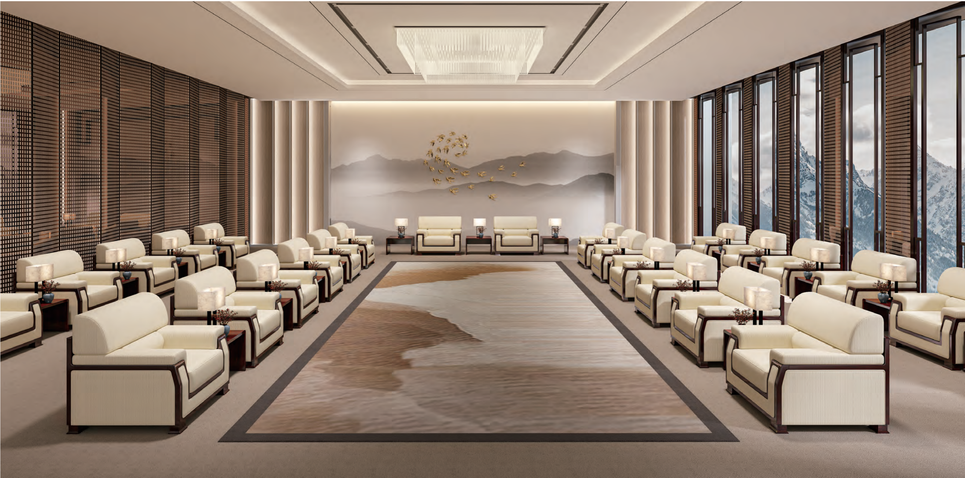
The symmetrical layout looks harmonious and helps to encourage equal communication.