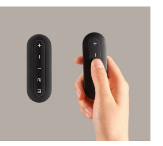
Manual controller is removable for remote control